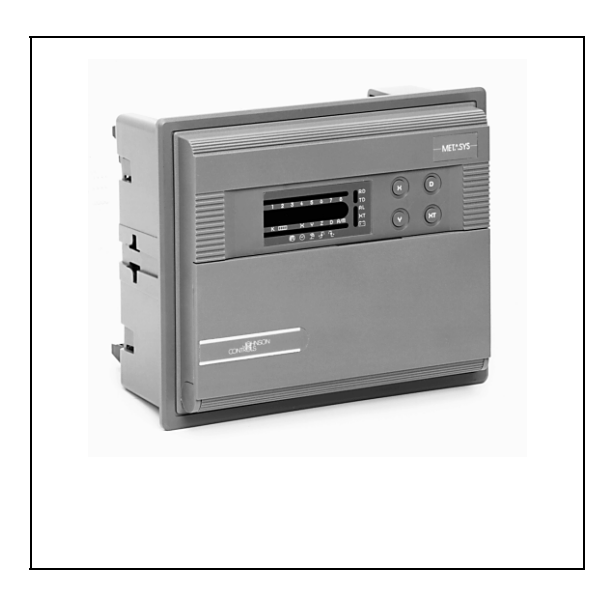
Figure 5: DX-9100 with LED Display and Keyboard in Cabinet Door Mounting Frame