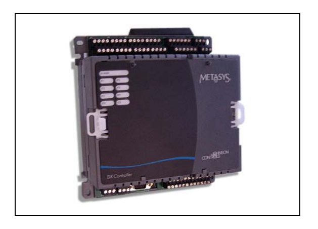
Figure 6: DX Controller – Black Box – on Panel Mounting Base