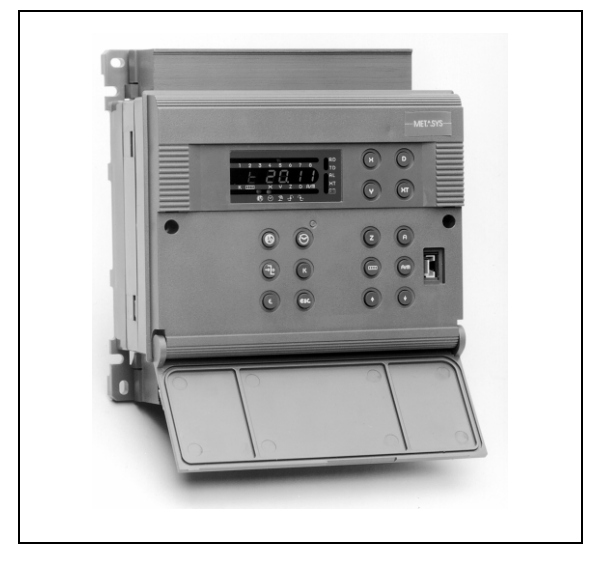
Figure 4: DX Controller with LED Display and Keyboard on Panel Mounting Base

the terminals and connections to enable the field