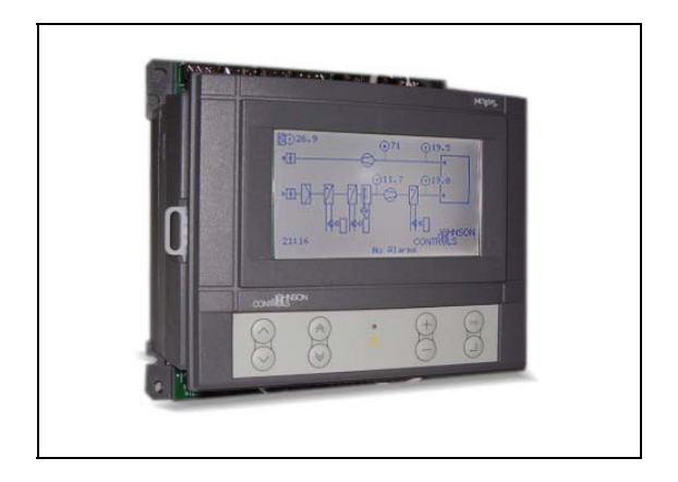
Figure 7: DX Controller with DT-9100 Display Unit on Panel Mounting Base