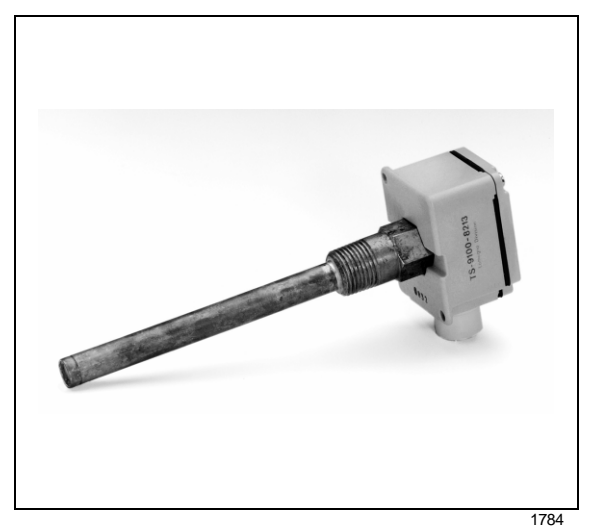
Figure 9: Flow Temperature Sensor

range, as well as industry standard 4-20mA transmitters. Outputs are available to control both proportional and incremental electric actuators, as well as motor control relays, staged heating and cooling and other electrical equipment such as lighting control relays. Pneumatic actuators may be controlled by the use of an external transducer.