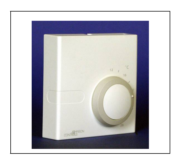
Figure 10: Room Temperature Sensor